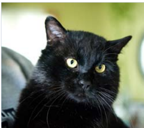
Katie (top) and Panther (below) are available for adoption.

Panther is one handsome fellow. He's been roaming the streets of Minneapolis for several years and the family that has fed him finally convinced him to come inside on Christmas day, 2008. His fosters think he's one of the nicest cats they've met. He gets along with another cat even if it isn't fond of him. He likes to play. He loves to snuggle and give kisses and, given his size, he'll keep you nice and warm during some cold winter weather. For more info on Panther email cats@pethavenmn.org .