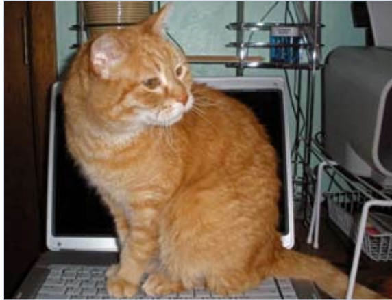
Right: Maggie supervises the writing of this month's column.

Hi, this is Maggie and I just discovered I am not the only old crabby lady in the house! Let me tell you about it. Just the other day momma was reminiscing about how things have changed for Pet Haven since she became involved 30 years ago-talk about old!! Did you know that Pet Haven has been around since 1952? But she says the most important things remain the same, like finding new homes for cats and dogs, educating people about the importance of spay and neuter and how to take care of animals. (Momma said it is a good thing I am spayed because we do not need any more little crabby cats like me running around.)