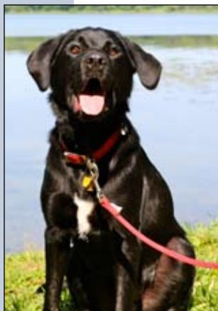
Foster at his favorite place, Lake Ann.

a foster parent, were awaiting the fate of Foster. The black lab/Newfoundland mix had developed a growth on his neck and had a fever of up to 105 degrees. Would the triple dose of antibiotics stop the infection? The untimely illness caused the pooch and those who loved him a night of worry and stress.