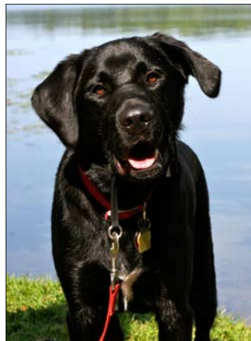
Foster is a playful, polite, and very lucky dog; not even a serious illness kept him from finding a new family.