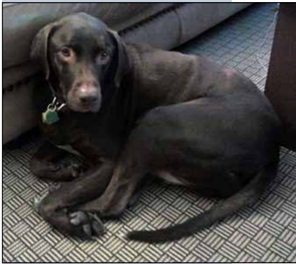
Above: Buddy is waiting to meet you!

If you would like meet any of these ladies – or any of our other adoptable cats or dogs – visit www.pethavenmn.org and submit a completed adoption application. One of our volunteers will get back to you promptly!