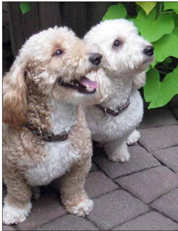
Quincy and Barney came to Pet Haven from Red Lake Rosie's, and from there they found their forever home